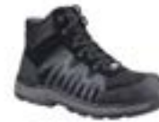
BLACK/DARK GREY P725795 Microfibre and Mesh