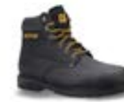
BLACK P724623 Waxed Full Grain Leather