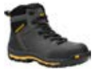
DARK SHADOW P720161 Nubuck/Kurim