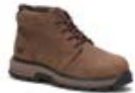
PYRAMID P725287 Full Grain Leather