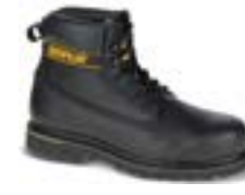
BLACK P708030 Full Grain Leather