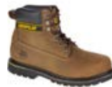
BROWN P708029 Full Grain Leather