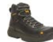
DARK BROWN P72694 Full Grain Leather