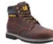
BROWN P724629 Waxed Full Grain Leather