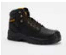
BLACK P724913 WAXED FULL GRAIN LEATJHER