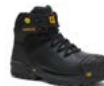
DARK BROWN P725136 Full Grain Leather