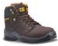
BLACK P724853 Waxed Full Grain Leather