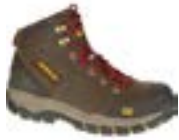
CLAY P719478 Nubuck