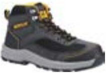
GREY P725078 Microfiber and Mesh