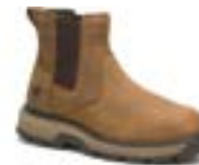
PYRAMID P725288 Full Grain Leather