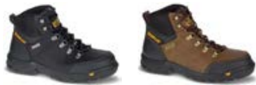
BLACK P722603 Full Grain Leather